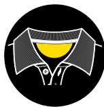
HALF MOON YOKE