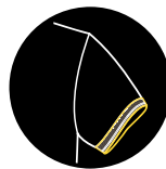
CUFFED SLEEVES WITH MATCHING ROD DESIGN